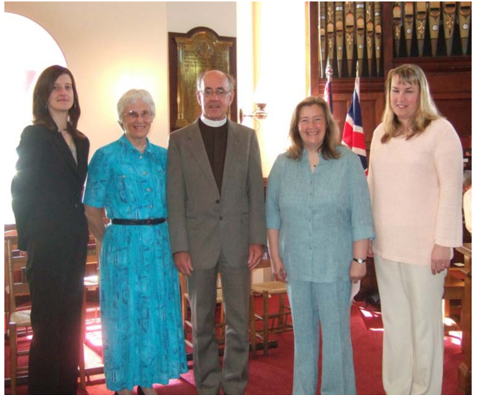
Our new elders after they were ordained at the end of August