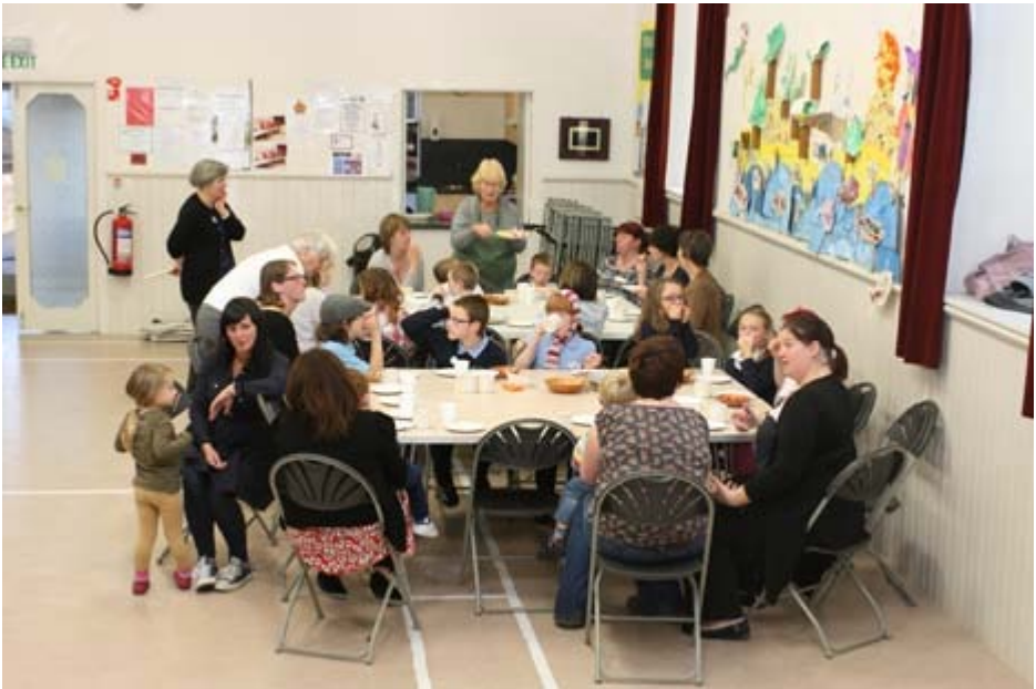
MESSY CHURCH IN SESSION

NEXT MESSY CHURCH DATE THURSDAY 17 JANUARY